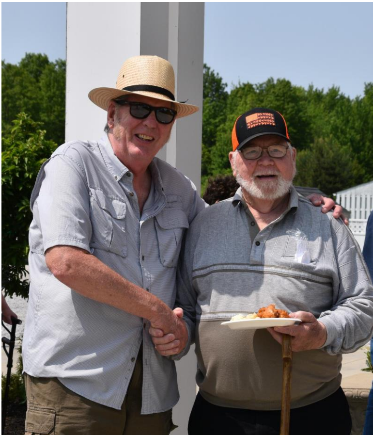
Two handsome, young gentlemen!