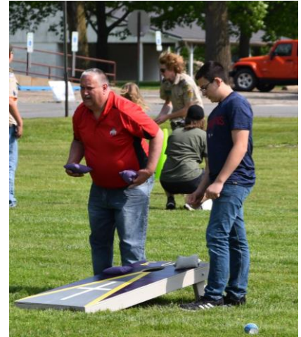
Fun with games