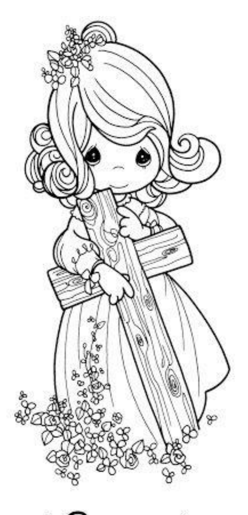
1 Believe In The Old Rugged Cross