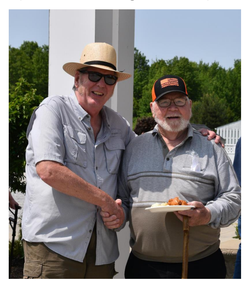
Two handsome, young gentlemen!