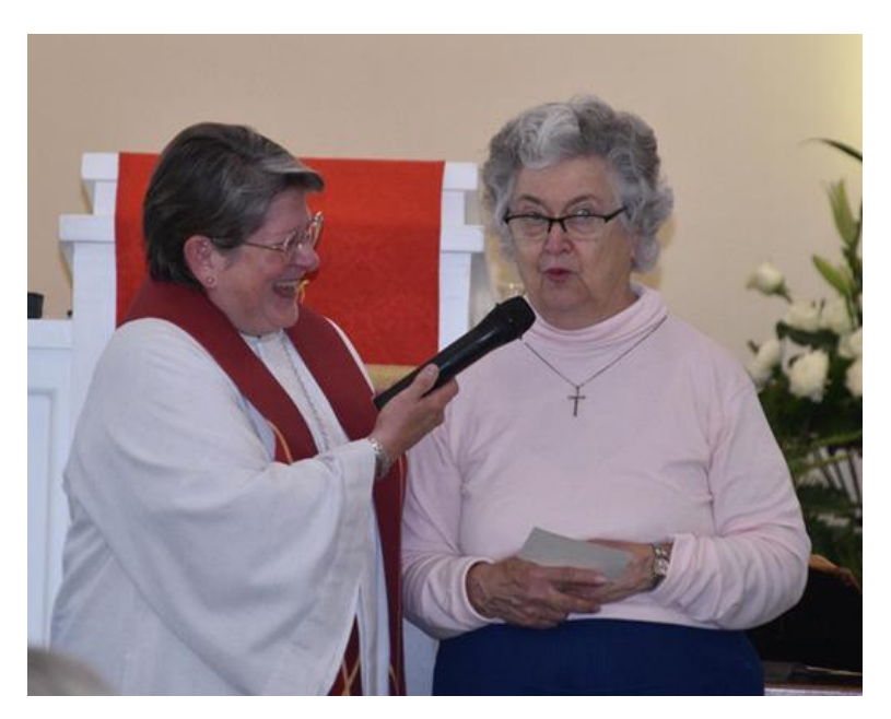
Enjoyed all the stories told!