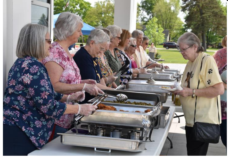
Thank you to all the people that helped with the food and serving.