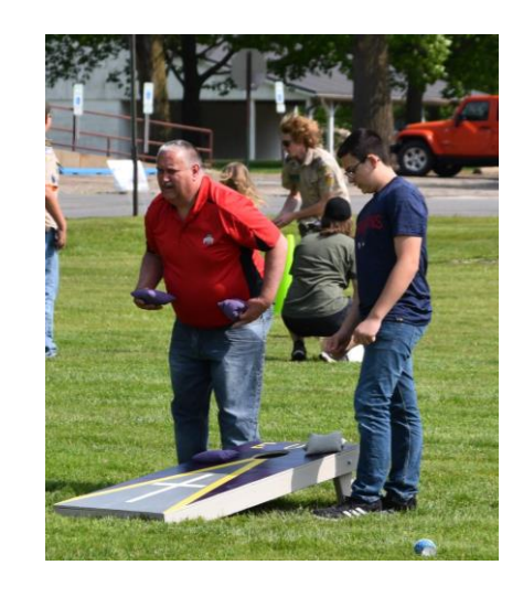
Fun with games