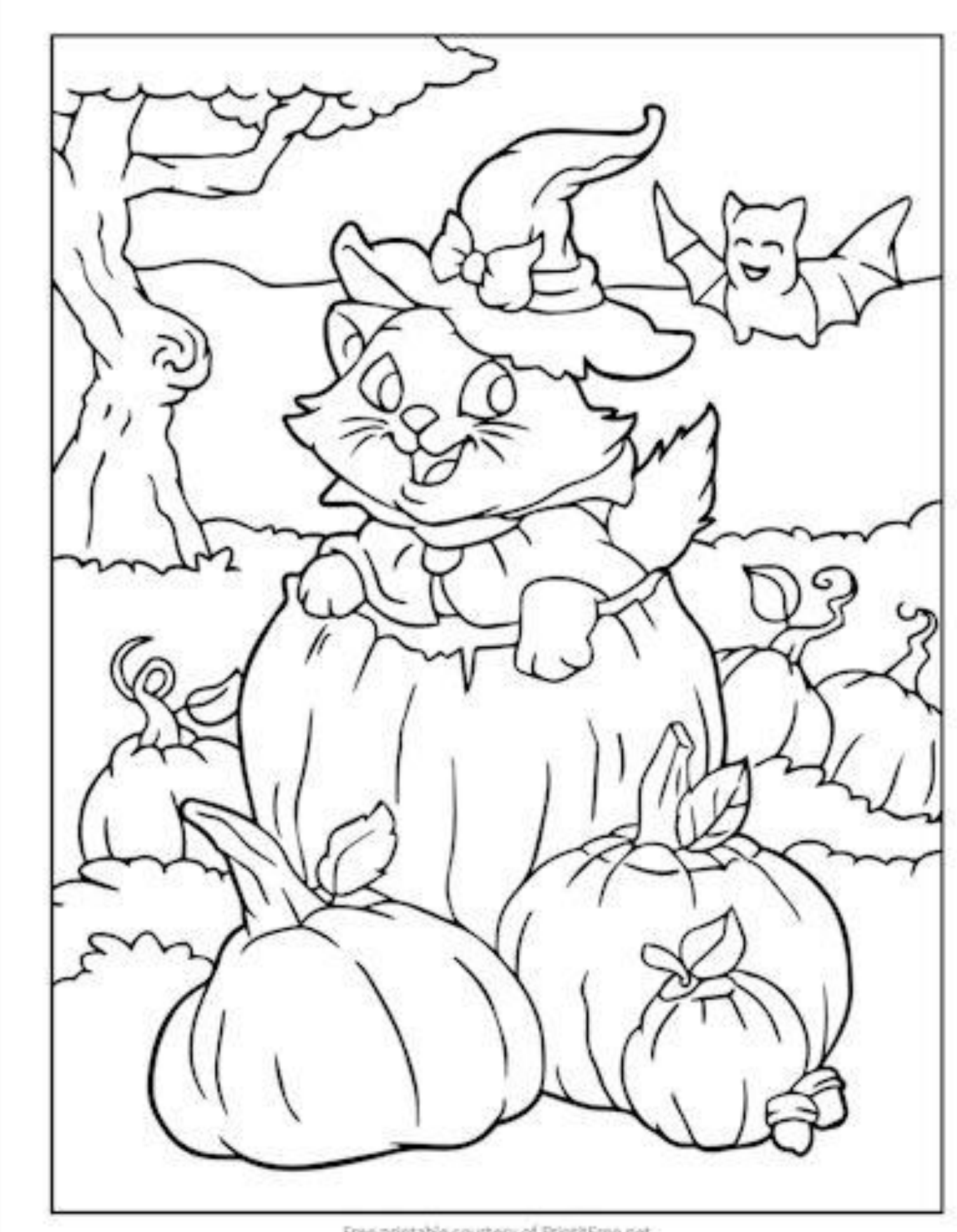
Free printable